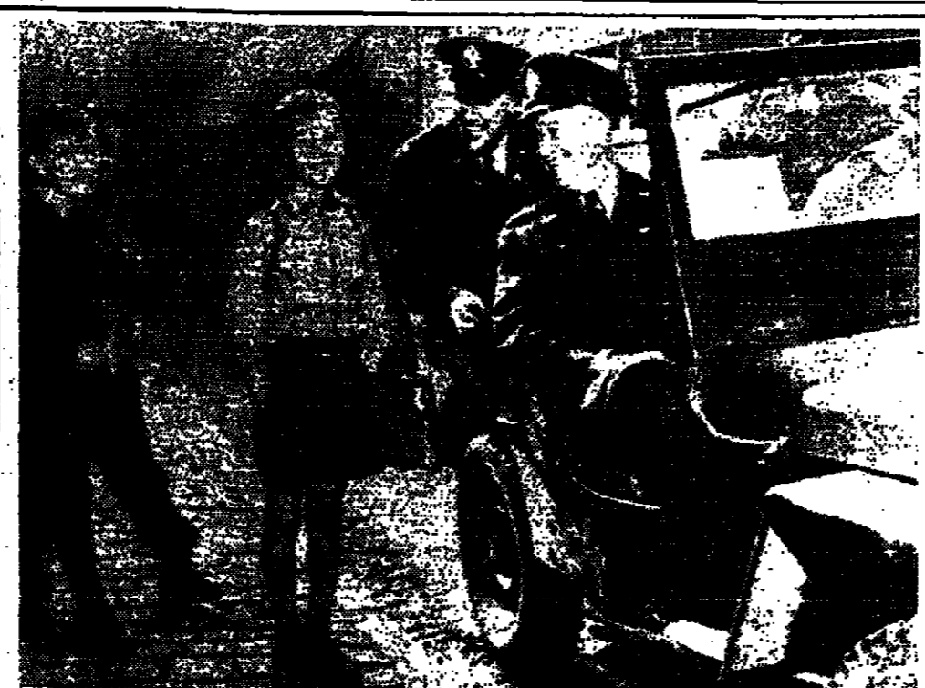
WHO REMEMBERS THE BOYS? — This 1945 file photo has been released by the U.S. Army to be published in West Germany in an attempt to track down the three boys in the picture, who stopped Gen. Dwight D. Eisenhower for a chat in the Frankfurt area shortly after the end of World War II. The Army plans a dinner if any of the three can be located.

WASHINGTON — The White House has received a blueprint for active presidency that urges Reagan to have a list of four major objectives to pursue and not be sidetracked by other people.